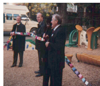
Congressman McGovern dedicates the playground. Watch the Video